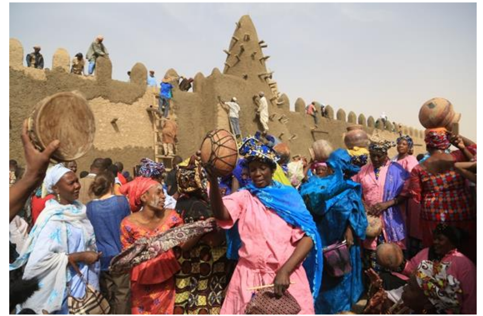
Plastering Mosque Djingareyber in Timbuktu, Mali, February 2017

Successful policies must be both place-based and people-centered. This strengthens community ownership, and social inclusion, improves livability of the built environment, and accelerates the socioeconomic recovery of cities. This new concept is the essence of the recently launched CURE Framework , which integrates place-based and people-centered approaches through culture into sustainable urban development policies, to help cities effectively address the impact of urban crises.