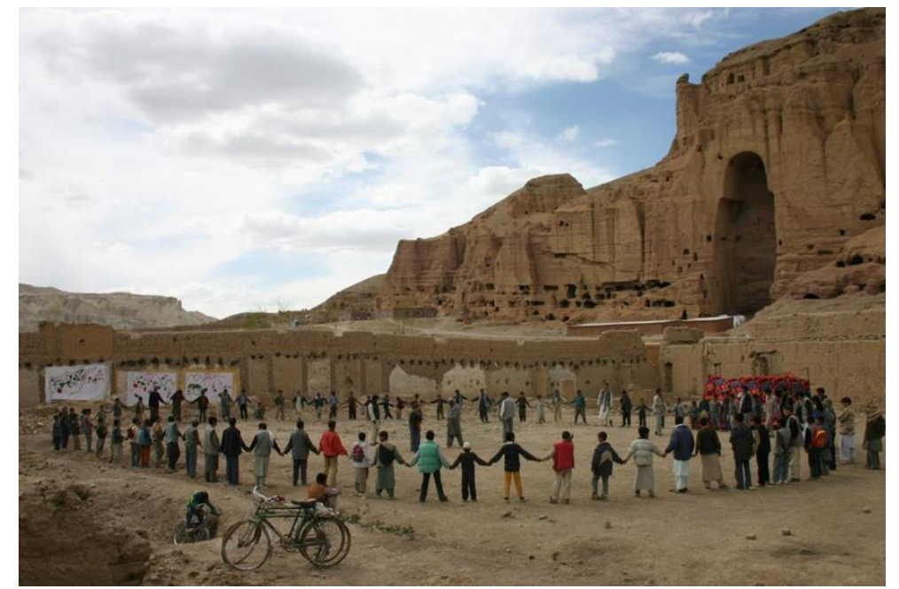
Mobile Mini Circus for Children, Bamiyan, Afghanistan.